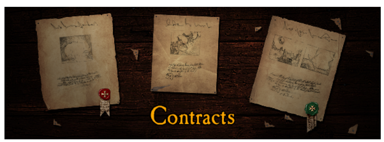
Contracts - Complete one-off tasks like killing a Rat Ogre on a specific difficulty or completing a certain map with a Grimoire and be rewarded with crafting tokens or boons. Special Key Contracts grant Quest Progress.