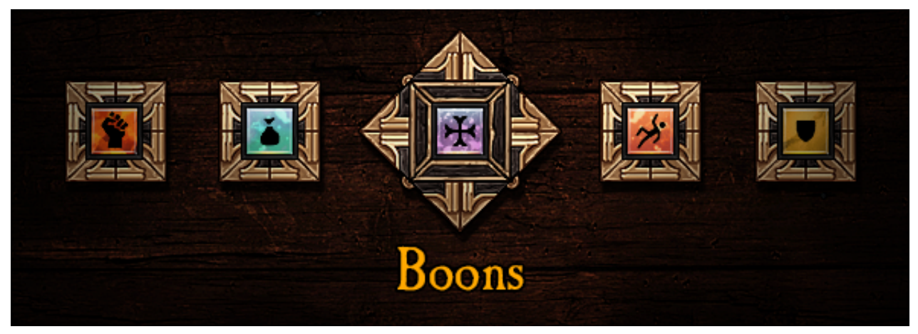
Boons - These timed power-ups activate once you complete a contract and provide an excellent tool for taking on tough challenges, such as Cataclysm or Last Stand.