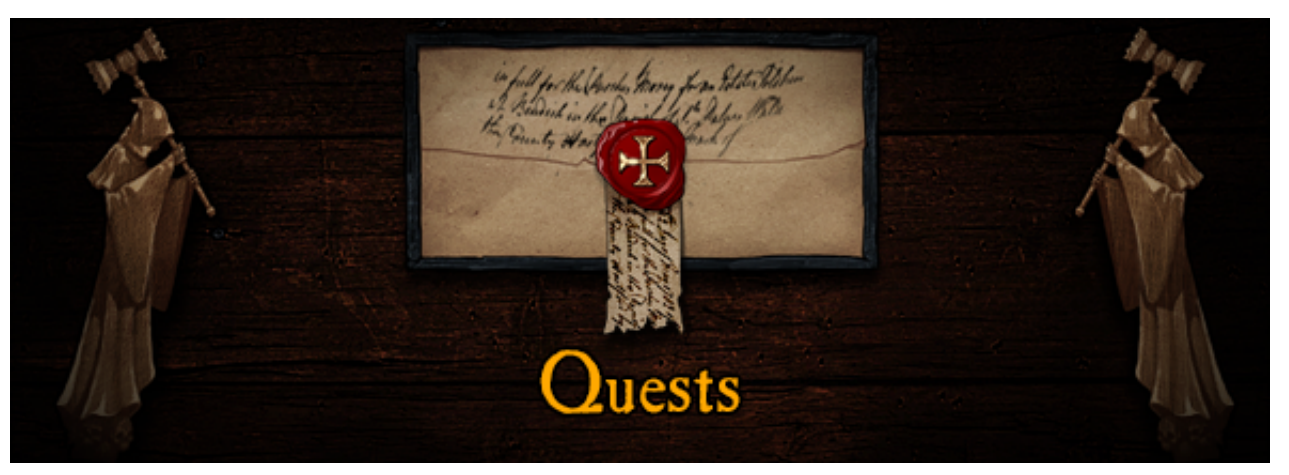
Quests - Complete key contracts to progress your quest. Once you have finished the required amount, you complete the quest and collect an epic reward.